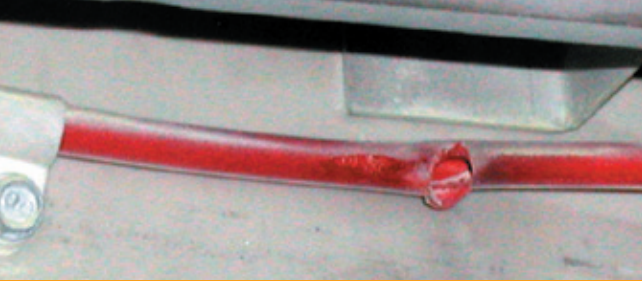
The Firetrace tubing “bursts” at the point of highest heat, triggering the release of the fire suppressing agent.