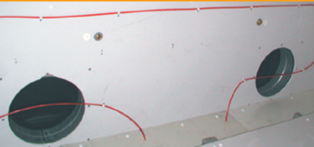
Firetrace detection tubing installed in front of the fume cabinet’s exhaust – directly in the path of a fire.