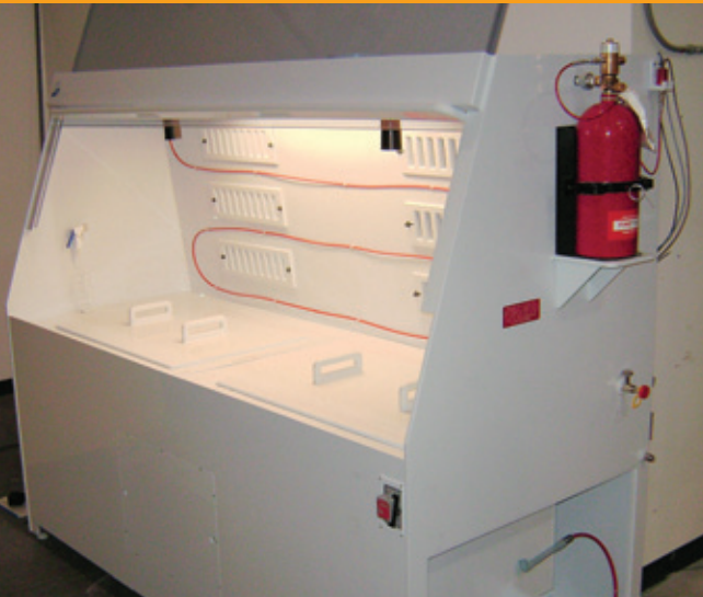
Firetrace detection tubing installed behind the fume cabinet’s baffle assures fast and reliable fire detection.